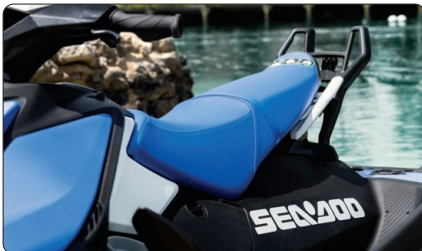
Slim Seat Designed to improve freedom of movement while riding.