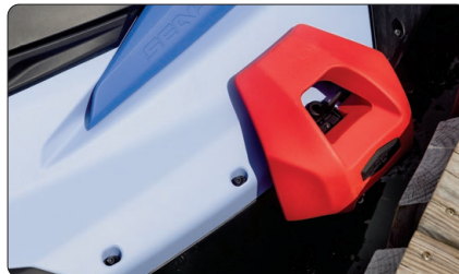
LinQ Lite Integration Quickly accessible and located at 7 points of the unit. The full array of Sea-Doo LinQ lite accessories can be integrated.