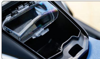
Front Storage and Watertight Phone Compartment A front storage for easier access to bring more gear on board. Easily secure cell phone and valuable items with the watertight phone compartment.