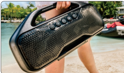
BRP Audio - Portable System (optional) An optional BRP Audio portable system is also available for an extra dose of entertainment. The BRP audio-portable system provides higher quality sound on and off the water featuring Concert, Ride and Home mode. Equipped with a heavy duty mounting bracket.