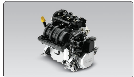
ROTAX® 900 ACE™ - 90 Fuel-efficient, compact and lightweight Rotax® engine.